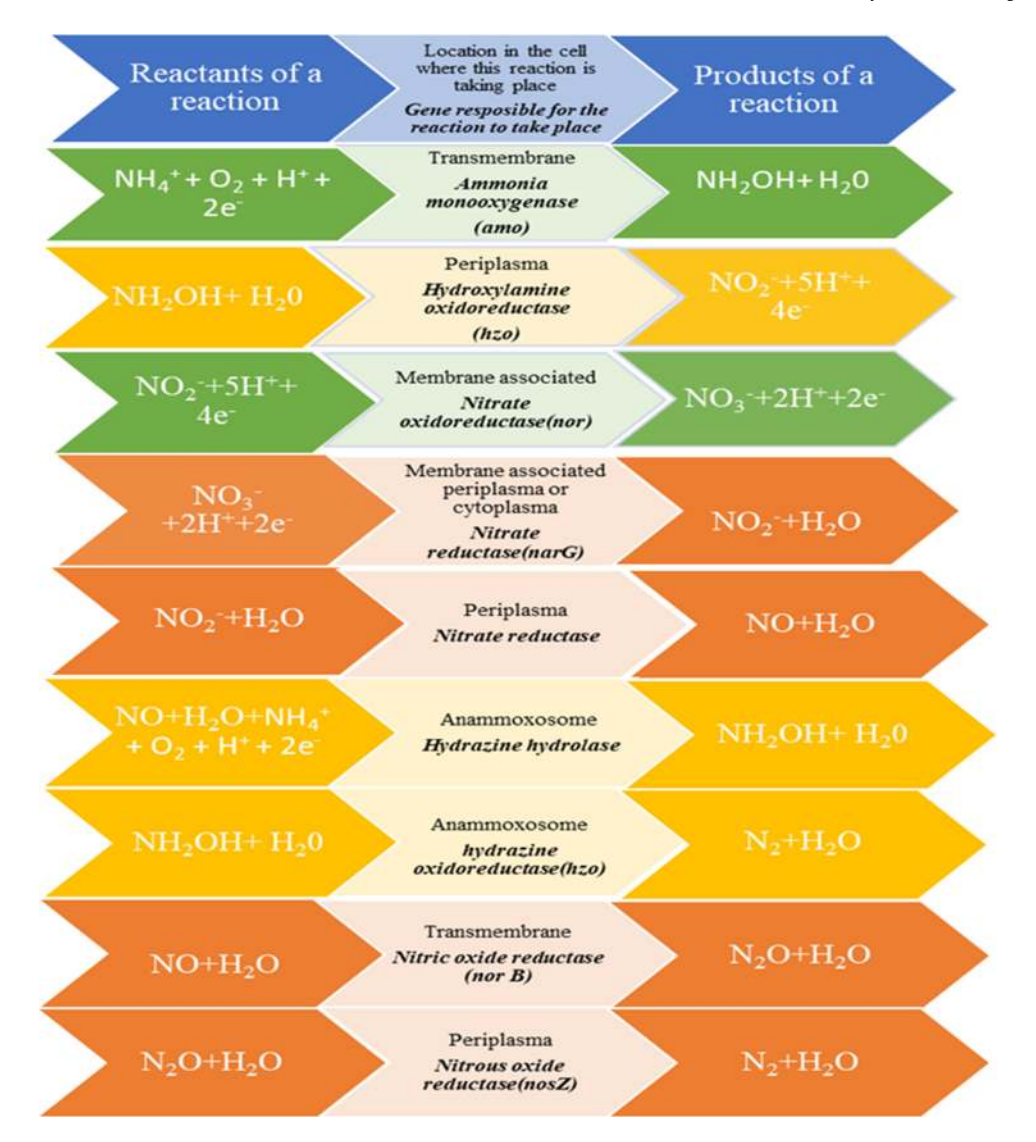
Fig. 1. Ammonia oxidation: Location of the reaction which is taking place in the microbial cell (either AOB, NOB, CMX, AMX bacteria) along with the enzymes involved. The different colour in the diagrams represents different processes- Green- Comammox; Yellow- Anammox; Orange-Denitrification.