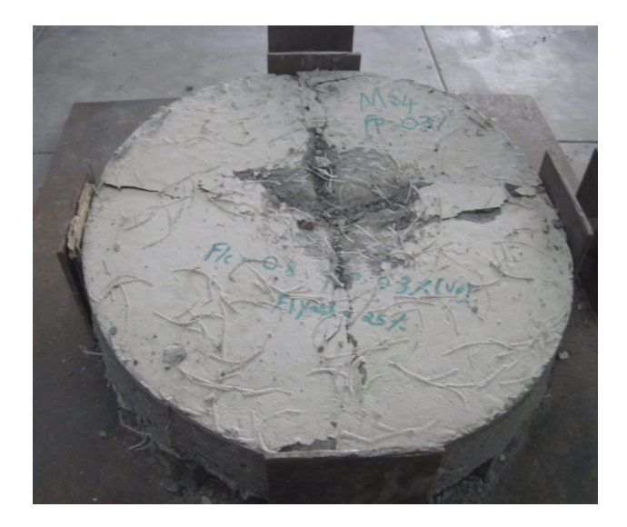
Figure 3. Slab specimen placed in metallic base with restrained ends.

strength polymer matrix. From the comparative analysis of plain and polymer incorporated concrete mixes it can be drawn that the presence of fibres provides a possible crack arresting mechanism by means of inhibiting the crack origination and propagation. The subsequent delay in crack formation and widening could possibly lead to higher cracking resistance even after failure. In the case