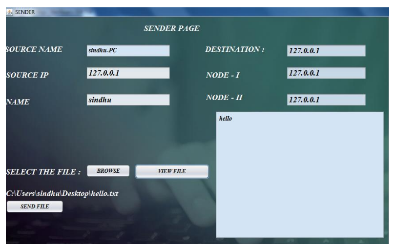
Figure 3. Interface for the sender