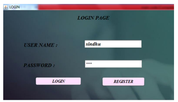
Figure 2. Main Interface for procedure