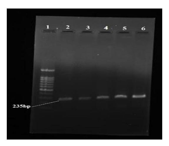
Figure 3. PCR amplification of Exon 1 of FSHR gene: Lane 1:100bp DNA Ladder, Lane 2-6: Amplified PCR Product of Exon 1 of FSHR gene