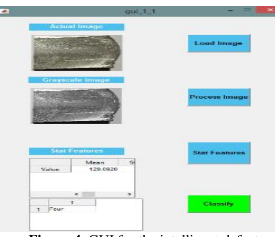
Figure 4. GUI for the intelligent defect classification system.

The Graphical User Interface (GUI) is important for the user to interact with the machine. GUI developed consists of two display units, two table units and four push buttons. The display unit 1 is used to show the loaded image and the display unit 2 is used to show the processed images. The table unit 1 is used to display the statistical features of the loaded image and the table unit 2 is used to display the classified result. The four push buttons includes, 'Load image' prompt for loading of the image to be classified, 'Process image' prompt for the conversion of the loaded image to gray scale, 'Stat Features' prompt for obtaining the statistical features of the loaded image and 'Classify' button to classify the weld image into one of the four categories based on statistical features obtained. The GUI developed a shown in the fig. 4.